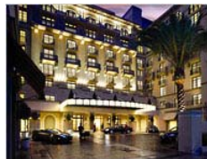
Montage Residences Beverly Hills.