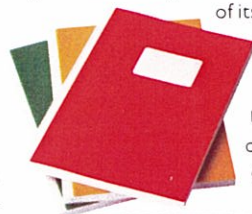
Top left

Last year, this hotel group launched the Seedlings program, which supports at-risk teens living near dozens of its Asian resorts and spas. The kids are matched with volunteer mentors from the resorts (who are trained at the University of Wales), and they can apply for scholarships ( banyantree.com ).